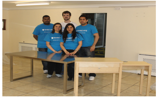
B. Barclays Bank Community Project

A. The Board of Trustees has initiated dialogue with the Officers of the Greenford Residents' Association. The first meeting was held on Wed. 8 th Feb. Such meetings will be held regularly to discuss relevant issues and chalk out a programme on how the Mandir can also serve the neighbouring community. Shree Jalarambapa extended his humanity to all without distinction & our Sadavrat have always been available to all who drop in. We hope to have more of our neighbours coming for lunch.