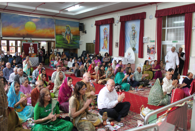
One Act Play based on Puja Bapa's Life History