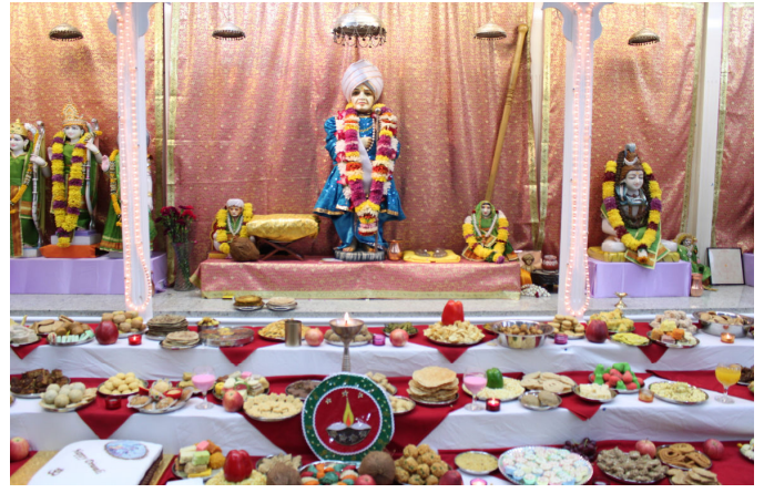
Nutan Varsha Annakuta Raj Bhog - 27th Oct. New Year