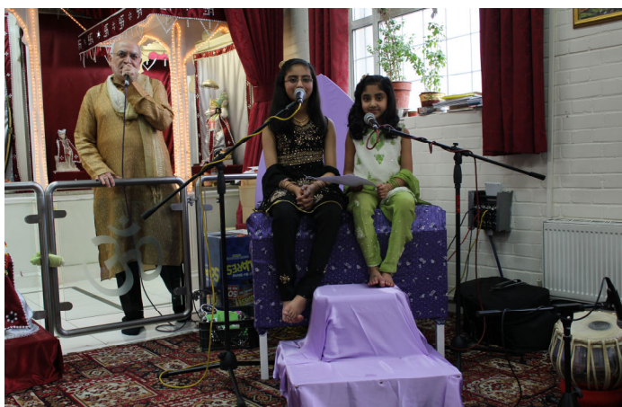
4 th Dec – 10 th Children’s Programme