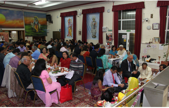
Samuha Chopada Poojan on 26th Oct. - Diwali Day