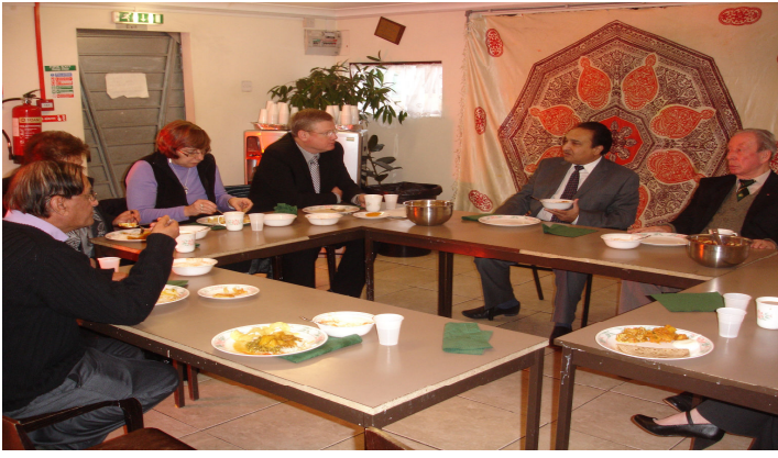
A. Meeting with Greenford Residents' Association